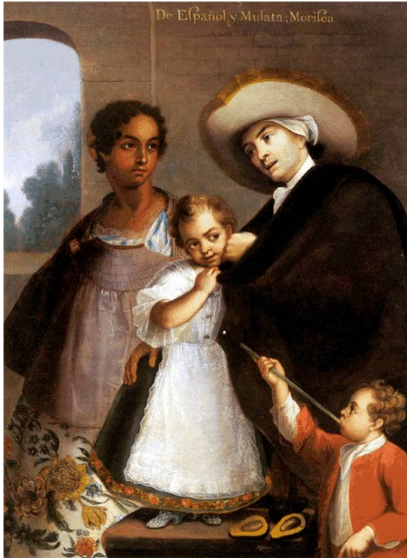
Creole Father, Mulatto Mother, Morisco Children

In the 1700s, artist Miguel Cabrera created a series of paintings depicting the various racial categories developing in the Spanish colonies.