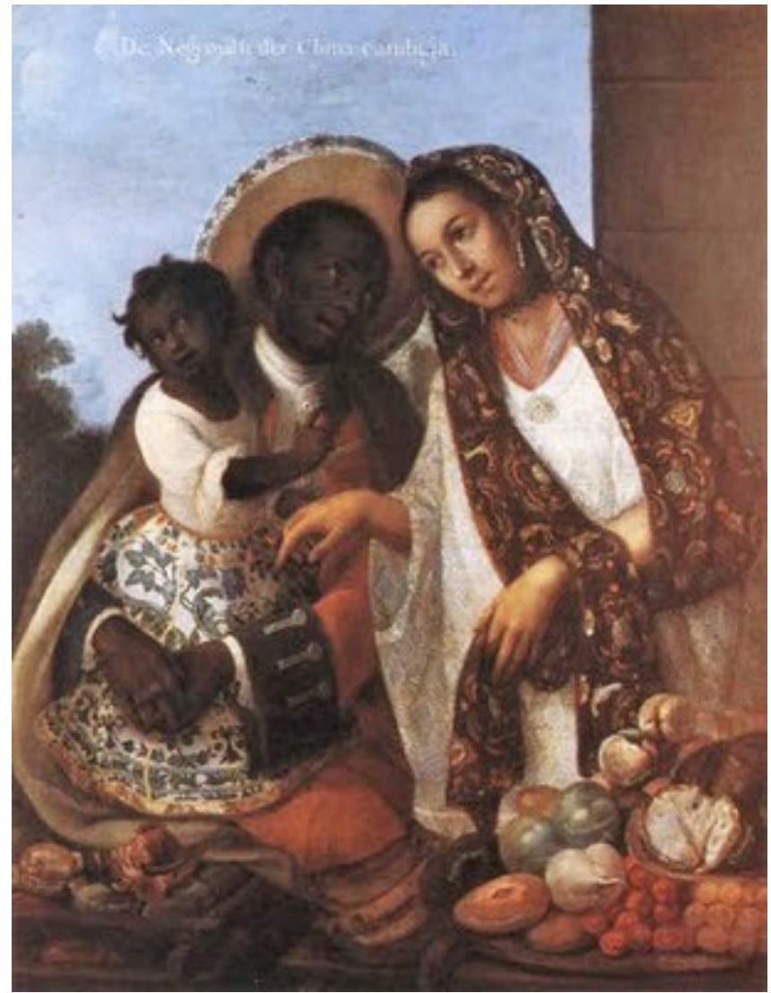
African Father, Native American Mother, Zambo Child