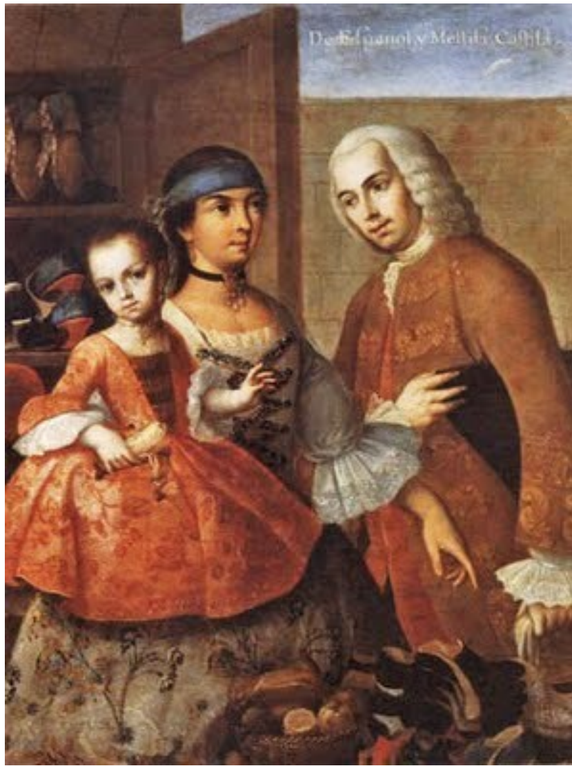
Creole Father, Mestiza Mother, Castiza Child