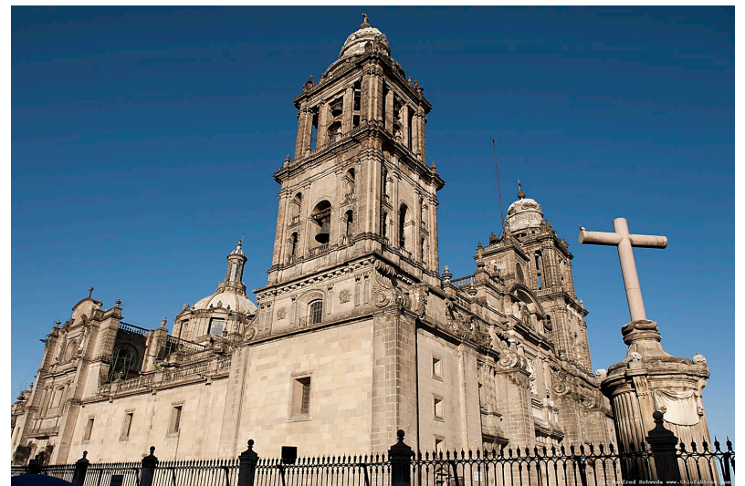
Catholic Cathedral in Mexico City (Formerly Tenochtitlán)