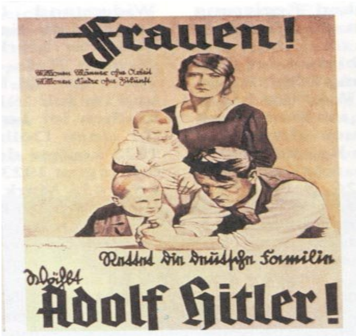
Poster: "Women! Millions of Men Are Without Work. Millions of Children are without a future. Save the German Family! Vote Adolf Hitler!" 1932

What emotions are communicated by the woman and baby in this poster? (list three); What is this poster an example of?; What emotions will be provoked by this poster? Who does it target?